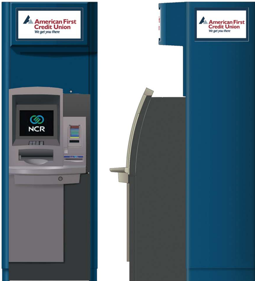
* Shown with optional backlit side sign.