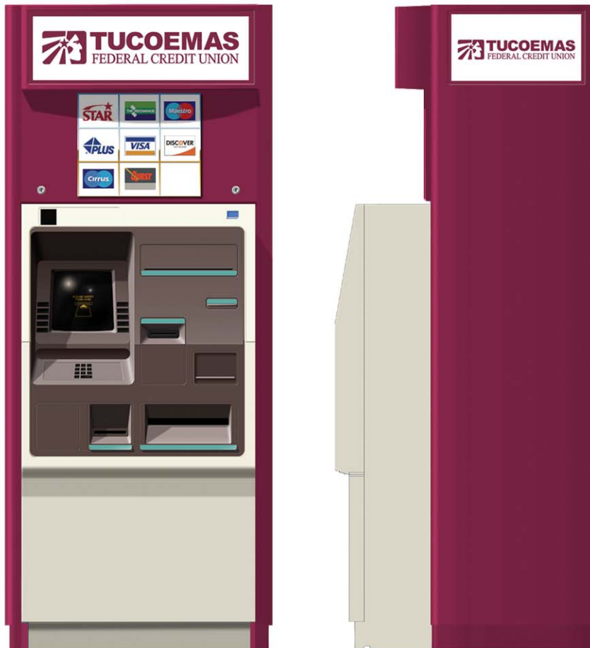
* Shown with optional backlit side sign and network display.