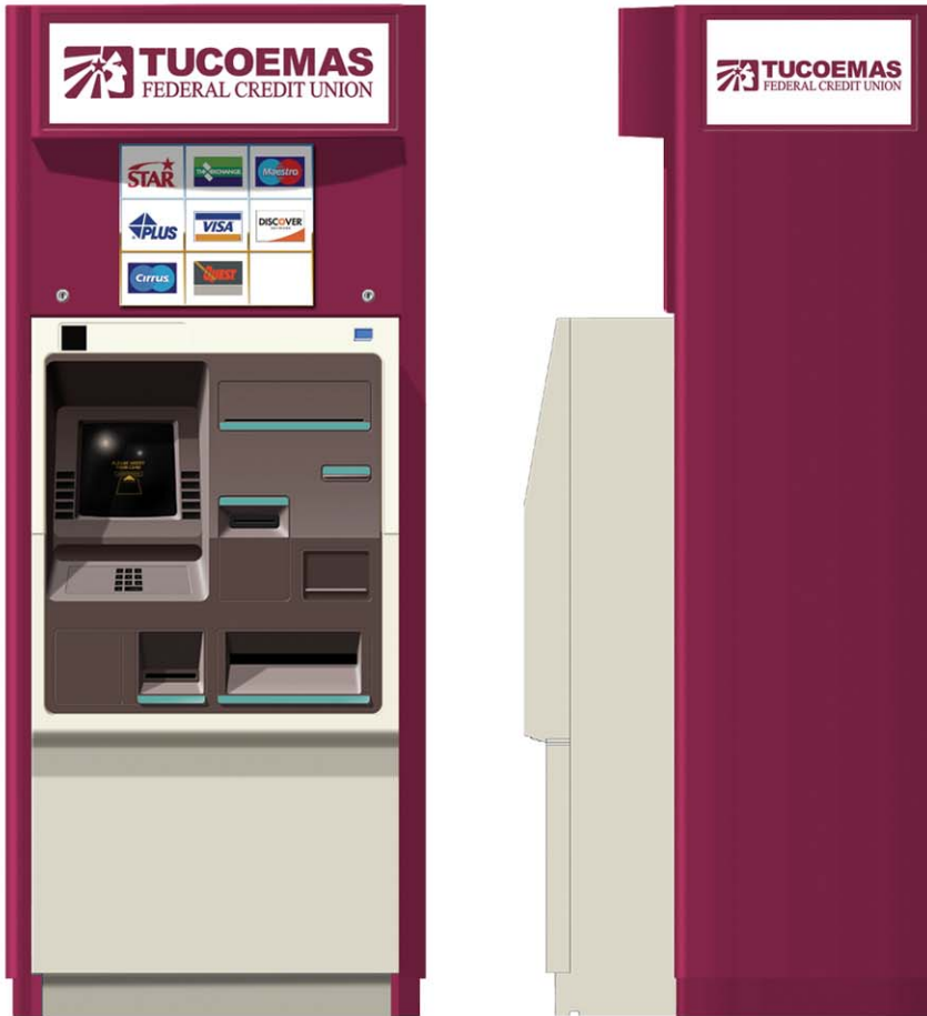
* Shown with optional backlit side sign and network display.