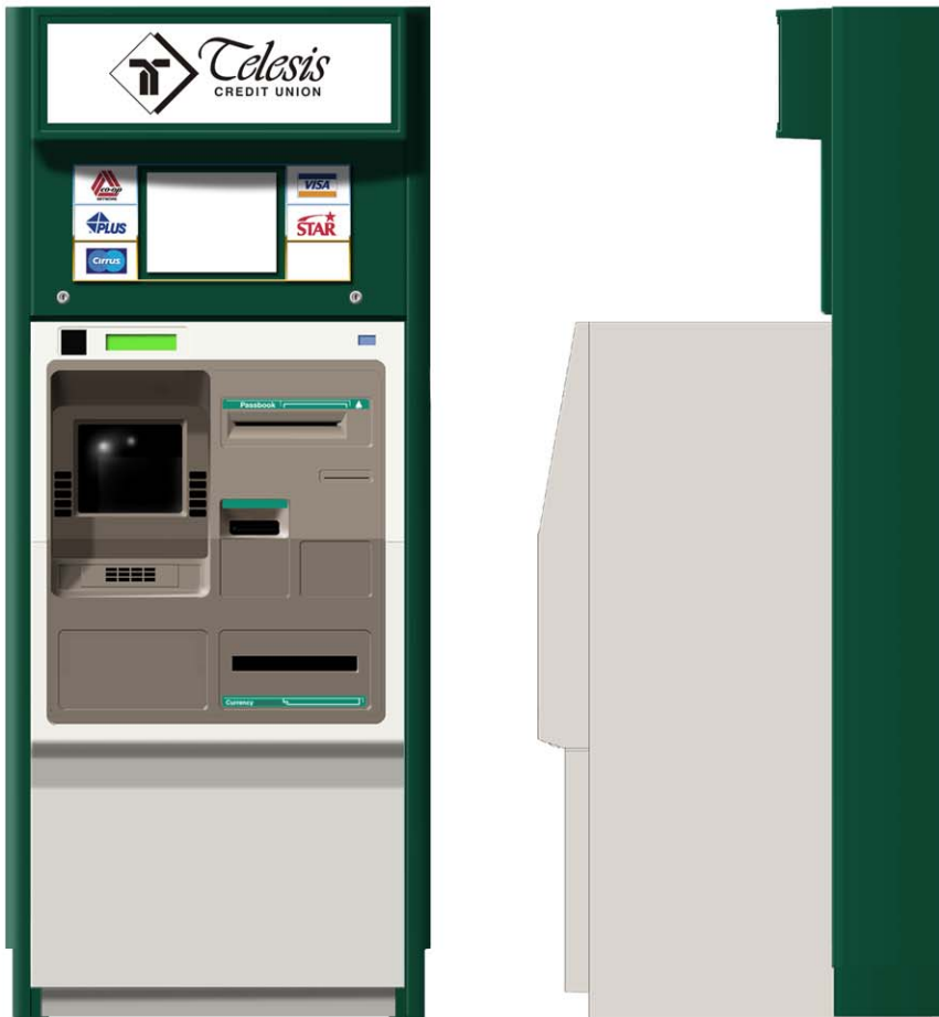
* Shown with optional network display and graphics panel.