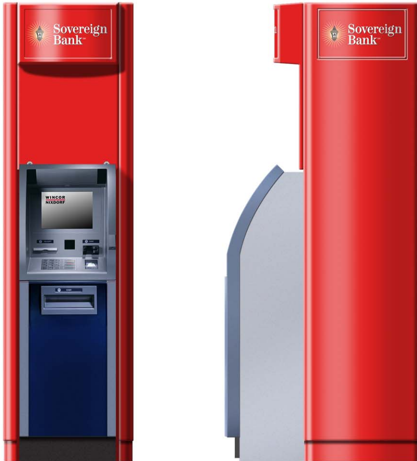
* Shown with optional backlit side sign.