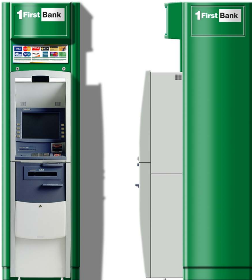
* Shown with optional backlit side signs and network display.