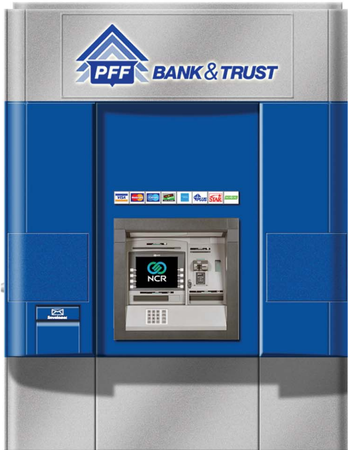
* Shown with optional strike zones and network display.