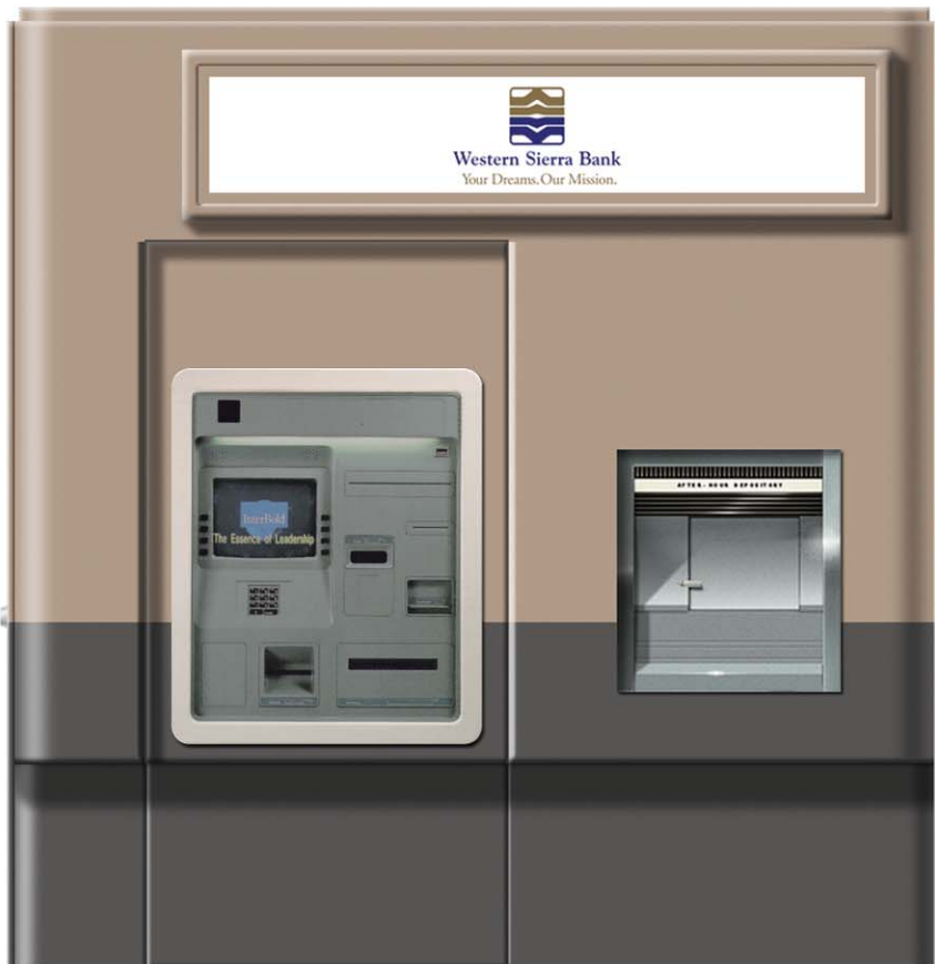
* Shown with optional backlit sign box.