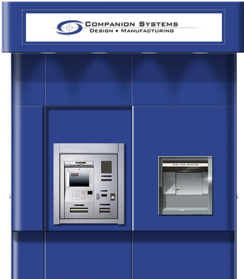
* Shown with optional front downlighting.