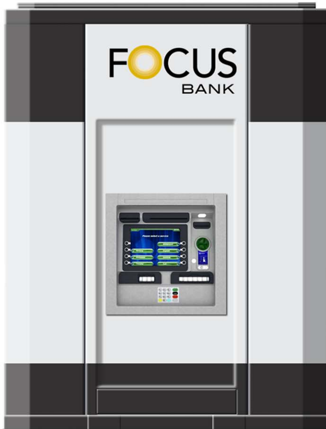
* Shown with optional graphic wrap.