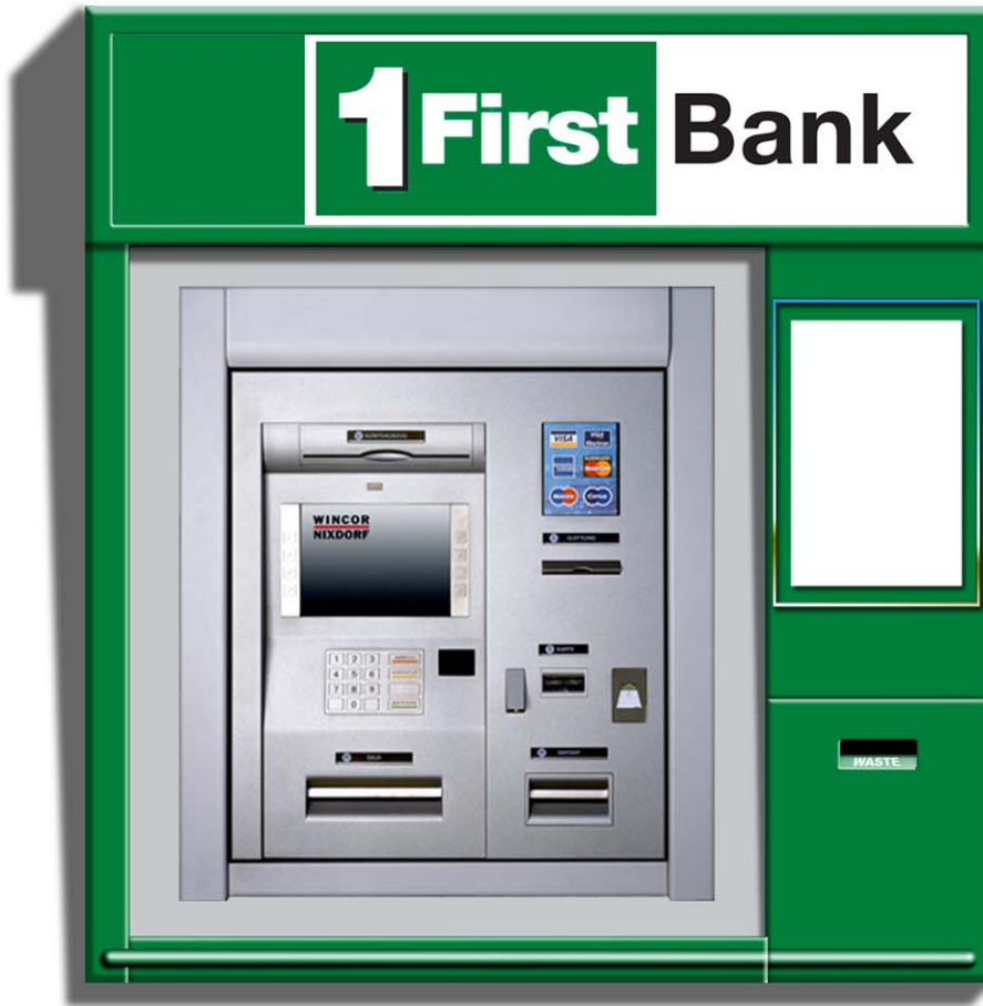
* Shown with optional network display and graphics panel.