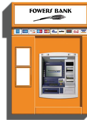
* 3132 shown with optional network display and graphics panel.