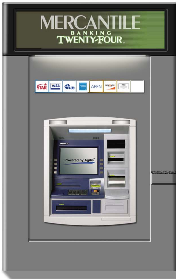
* Shown with optional network display.