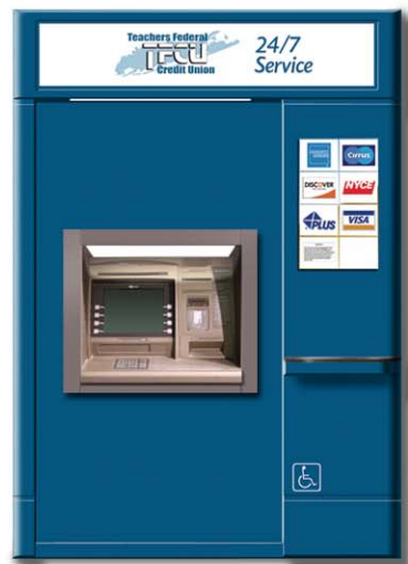
* 3675 shown with optional network display.