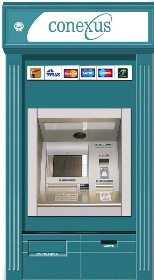
* Shown with optional network display.