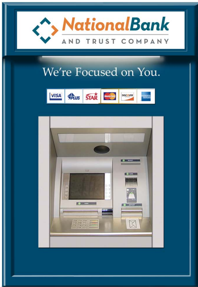
* Shown with optional network display.