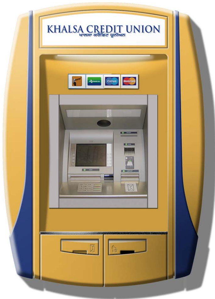
* Shown with optional network display.