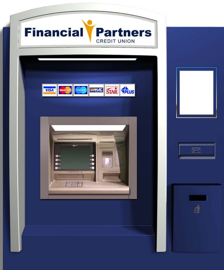
* Shown with optional network display and graphics panel.