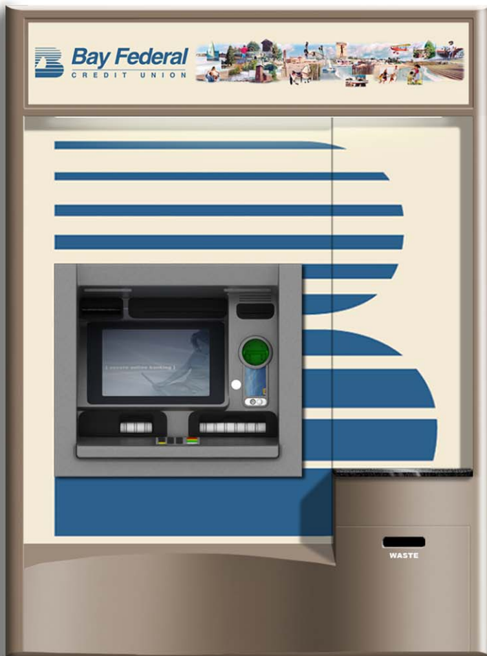
* 9372 shown with optional graphic wrap.