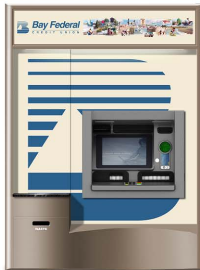
* 9373 shown with optional graphic wrap.