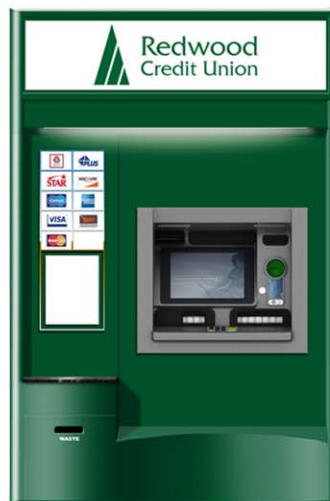
* 9377 shown with optional network and graphic displays