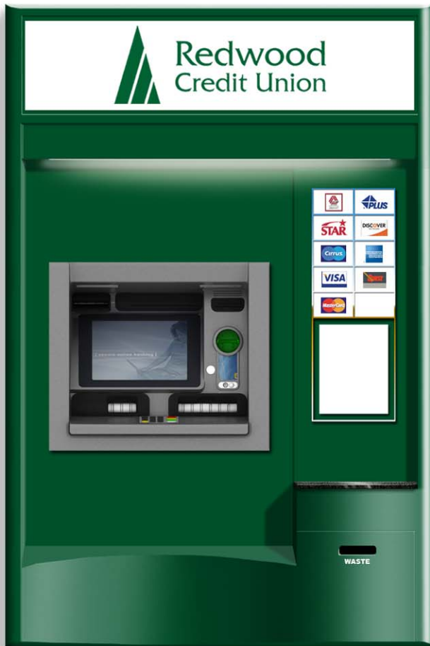
* 9376 shown with optional network and graphic displays