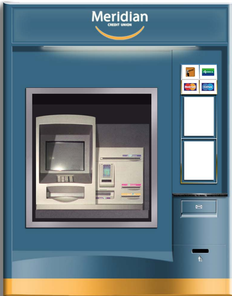
* Shown with optional network display and graphics panels.