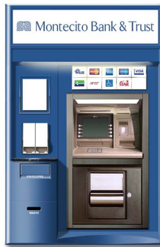
* 9389 shown with optional network display and graphics panels.