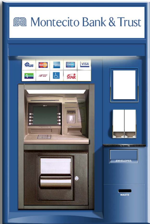
* 9388 shown with optional network display and graphics panels.