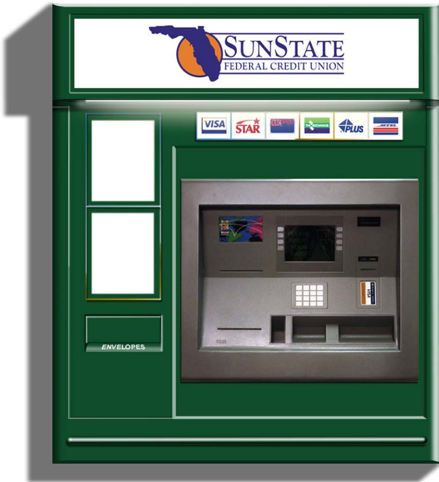
* Shown with optional bumper guard, network display, and graphics panels.