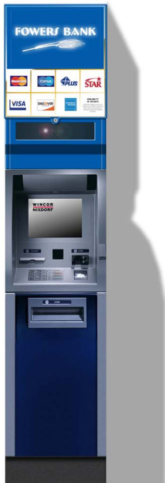
* Shown with optional camera window and network display.