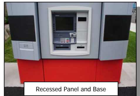
Recessed Panel and Base

Order your kiosk today www.companionsystems.com Toll Free: 800.258.8082