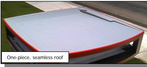
One-piece, seamless roof

In addition to protecting your ATM and kiosk against damage, we protect the interior of your kiosk from the water damage that is inherent in kiosks with seamed metal roofs. As the only kiosks in the industry with a one-piece, self contained, sealed roof and internal drainage system, our kiosks are also protected from unsightly streaking and will maintain their attractiveness for years to come.