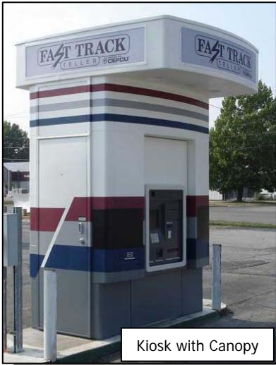
Kiosk with Canopy

From our patented Straight-Line Suspension (SLS) system and pre-treated and powder coated steel frame to our non-corrosive, fiberglass body and molded-in colors and textures, our ATM kiosks are simply the finest designed and built ATM kiosks in the industry.