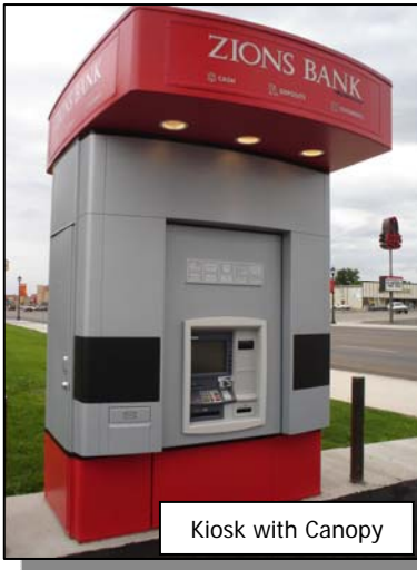
Kiosk with Canopy