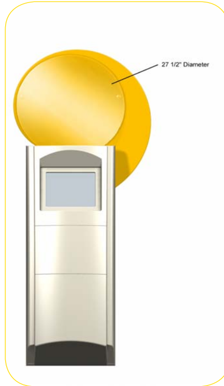
Option 2 :: "Swoop" Sail Painted MDF Back Acrylic Front Piece