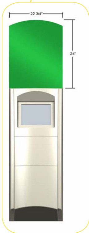
Option 1 :: Standard Sail Painted MDF